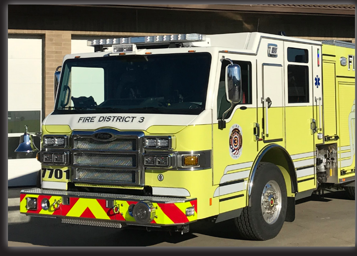
New Pierce engine, 7701, stationed at Central Point

The land was purchased and plans are currently in process for the newest station to be located at Scenic Avenue. Watch our progress as we hope to open in the Spring of 2020.