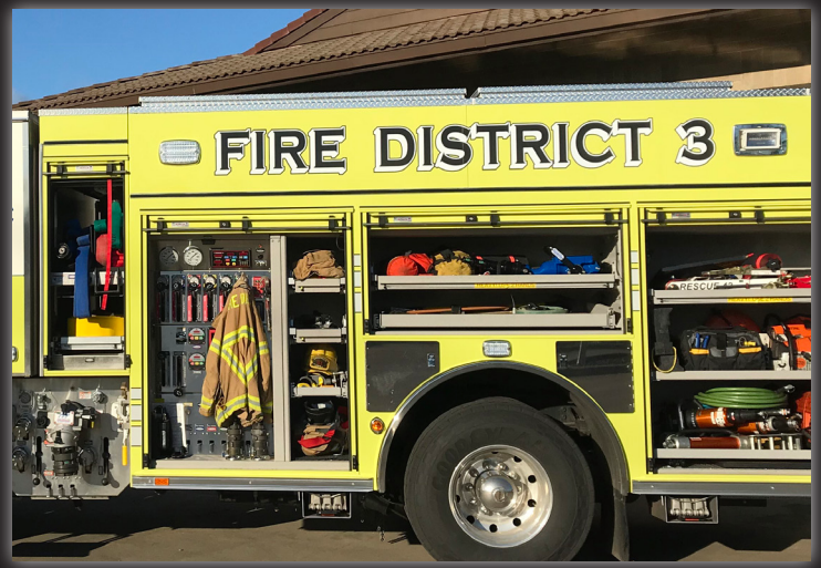
New Pierce engine, 7702, stationed at White City